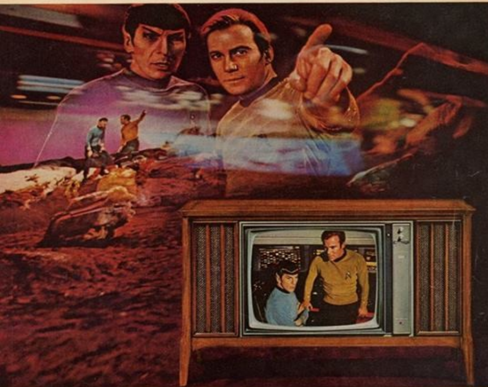
See "Star Trek" on RCA Victor Color TV. Shown above, The Hathaway.

When you're first in Color TV, there's got to be a reason.